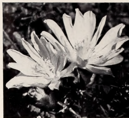
BITTERROOT Lewisia Rediviva

SHINLEAF, Pyrola Elliptica . Like the above but with fewer blossoms and these nearer the top of the stem. Same cultural directions as the above.